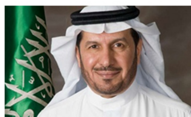
H.E. Dr Abdullah Al Rabeeah Former Minister of Health and Head of King Salman Relief Centre