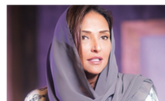
HRH Princess Lamia Bint Majid Al Saud