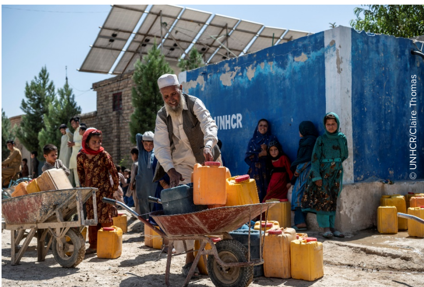
An elderly man collects water in Tarakhail Daag, Afghanistan.

UNHCR strives to address access barriers to healthcare and WASH services for displaced and host communities alike, in particular for persons at heightened risk such as the elderly. UNHCR's unique approach based on how conflict and displacement affect individuals differently depending on their age, gender, and diversity seeks to ensure that everyone can fully participate in and enjoy their rights on equal footing with others. That means consulting communities and taking into account their specific needs when interventions are designed. This approach ensures that people of concern who are particularly vulnerable to COVID-19 are included in UNHCR's planning process from the very beginning.