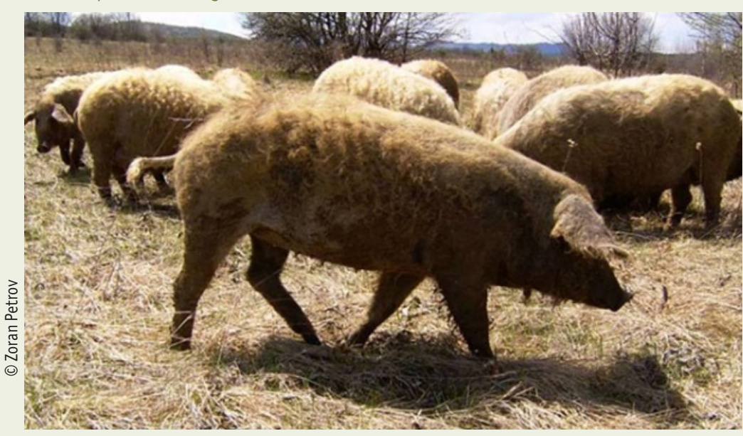
Figure 8 Mangulica pigs, an autochthonous breed of Serbia

autochthonous pig breeds in Serbia, considered endangered), sheep, goats, turkeys, ducks, geese, chickens, pheasants, badgers, owls, storks, feral cats and foxes.