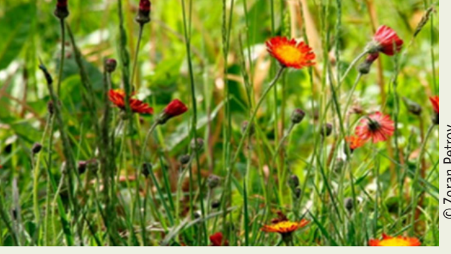
Figure 6 Pasture on the Petrov Biodynamic Farm

of 40 hectares of agricultural land. Alfalfa is the dominant crop grown specifically for domestic animal forage. In addition, the farm hosts various indigenous, autochthonous breeds of livestock. It is a registered dairy with a processing capacity of 5 tonnes. They produce milk, yoqurt, sour milk, sour cream, whey and chopped cheese.