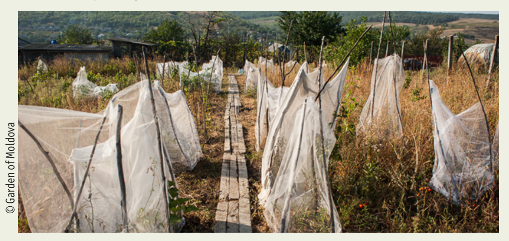
Figure 4 Isolating plants for seed production

This experimental garden and training area covers 3 000 m2. It is a system in transition: it was used intensively since 1975 and only became an agroecological plot of productive land in early 2016. It is now managed with knowledge sourced from biology, entomology, ecology, and engineering sciences for their water system and value adding to fresh produce. In terms of agroecological practices, the Garden of Moldova employs organic open-pollinated seeds, crop rotation, green manure, permanent mulch and soil covers, composting and practices no-dig in preparing the soil. There are no fish or livestock, instead the emphasis is on plant-based diets and natural biodiversity. Old trees exist on the property and young fruit trees have been planted from seed or grafted stock. The seed bank was initially stocked mostly with organic seeds received from other international seed banks, seed saver exchange groups and organic seed companies, as well as local private gardeners