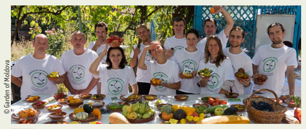
Figure 3 The Garden of Moldova's 2017 Festival of Biodiversity

The Garden of Moldova is an NGO located in the centre of the Republic of Moldova, in Cigirleni, a village of 2 500 inhabitants. The association was founded in 2015 and today has members and supporters spread across a country-wide network. Its mission is to promote and teach the different elements of agroecology, and to maintain a seed bank with both local and non-local varieties in order to ensure seed independence and food system resilience. This NGO tackles the big issues of industrial agriculture and disinformation about eco-friendly agriculture in their agroecological pedagogic training sessions and seed production on the family property of its founders. A landscape architect with a tertiary education in botany and plant physiology and identification who is now in charge of experimental gardening and training, is among their group founders. All the founders have sought training on agroecology over the last 9 years from several workshops around Europe, specifically in France, Belgium, Romania, and Austria.