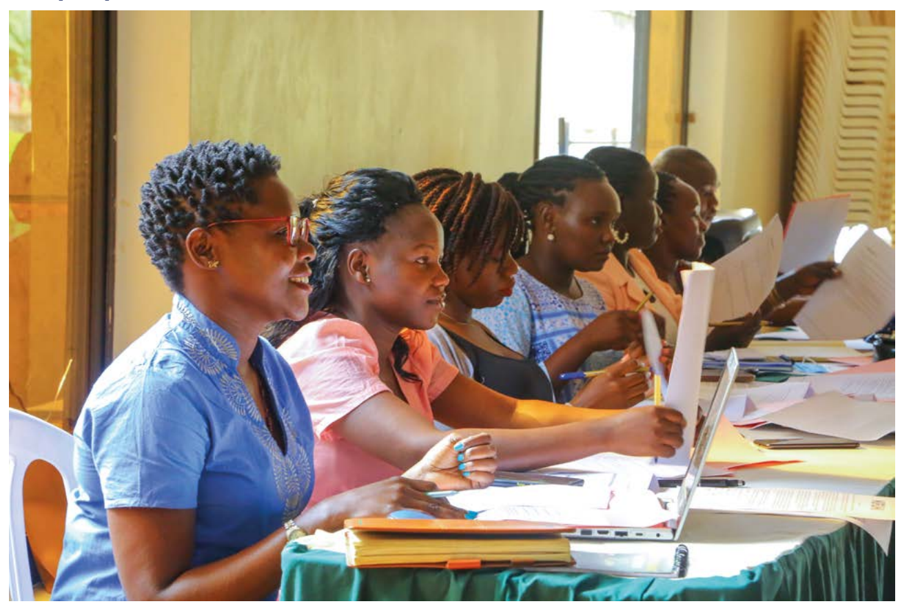
MIFUMI Movement Builders discuss domestic violence in Tororo, Uganda. MIFUMI, the largest women's rights agency operating at grassroots level in Uganda, received a Jo Cox Memorial Grant to deliver a 36-month project in Uganda to support service provision and peer support networks for survivors of sexual and gender-based violence and mobilise communities to tackle violence against women and girls.