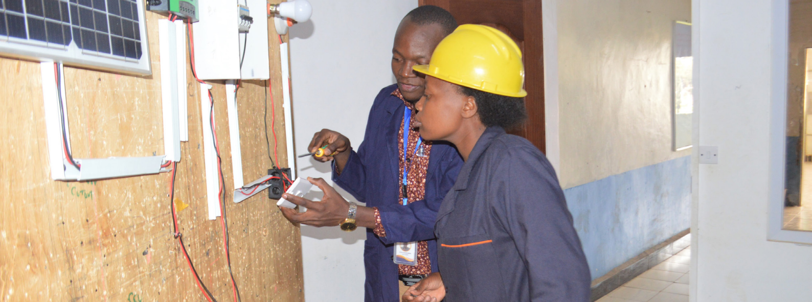
E-waste disposal, Nairobi, Kenya.