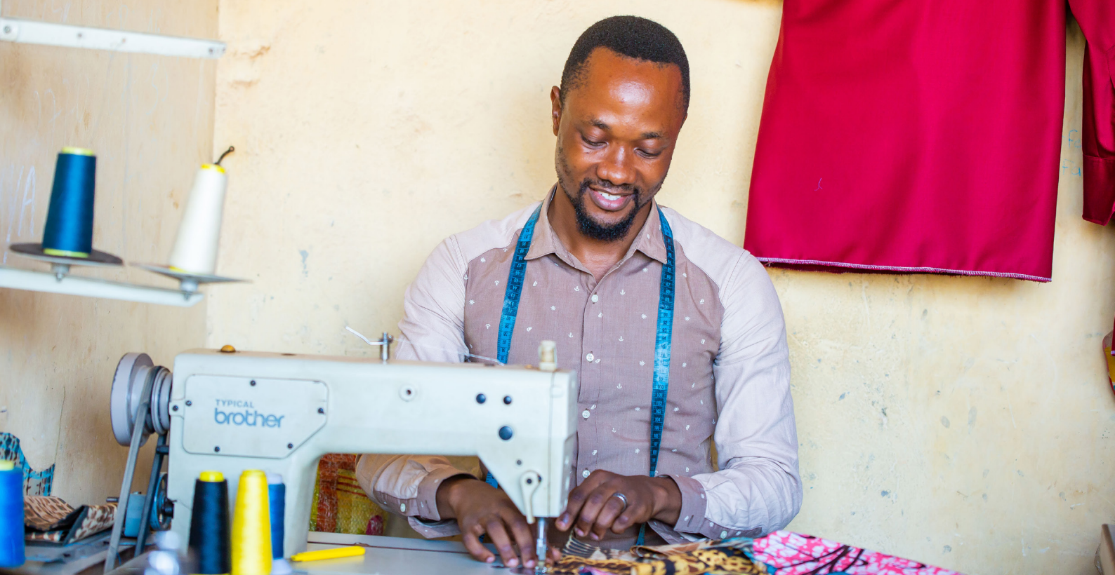
A refugee tailor at work in Kampala. The textiles sector is a popular livelihoods activity among refugees and hosts in Kampala and Nairobi.