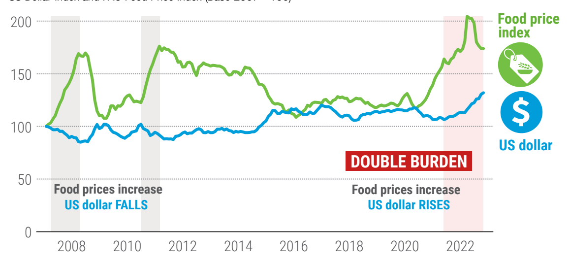
Figure 1. A double burden: high food prices and a strong US dollar US Dollar Index and FAO Food Price Index (Base 2007= 100)