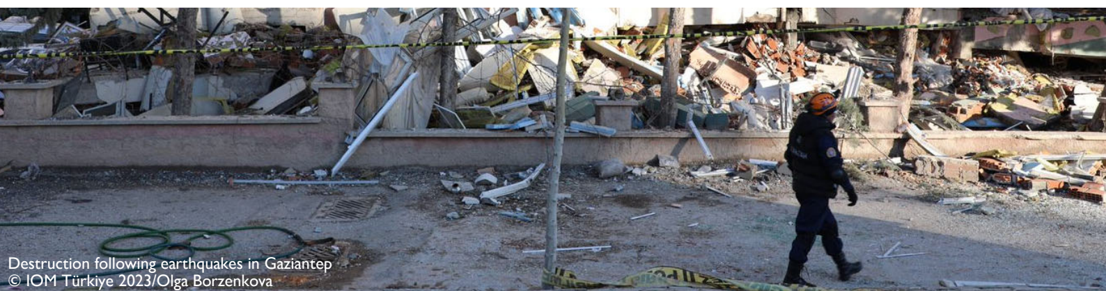
Destruction following earthquakes in Gaziantep