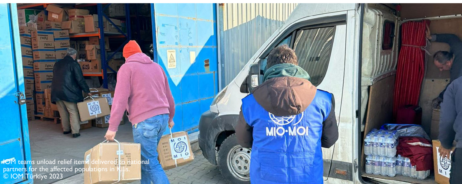
IOM teams unload relief items delivered to national partners for the affected populations in Kilis.