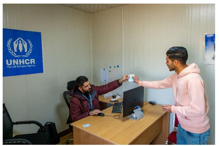
Since its establishment in 2017, the Zaatari Office of Employment has issued 26,500 work permits, including almost 3,000 in 2023, to facilitate access to formal jobs outside the camp.