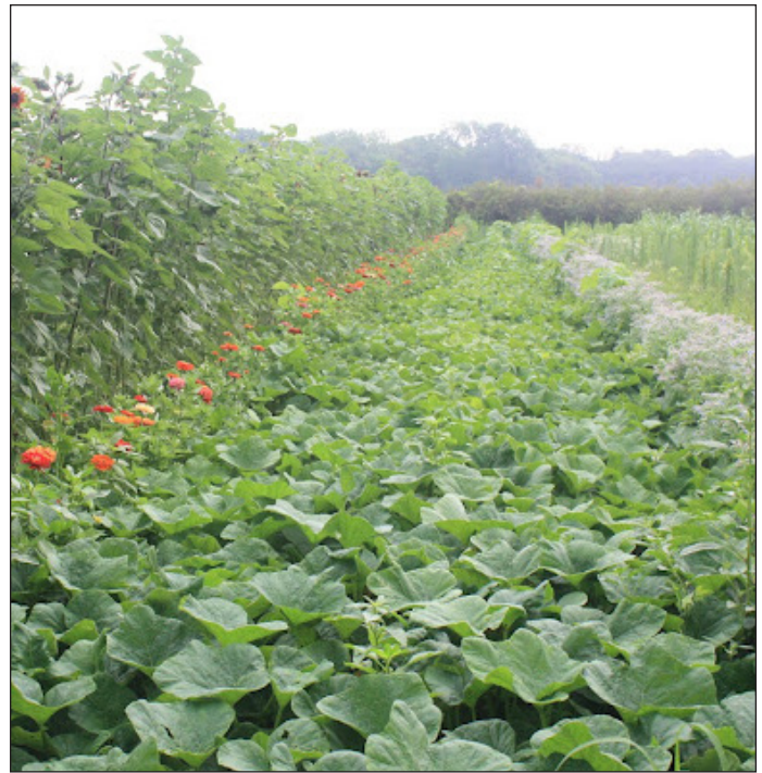
Research shows that intentional diversity in cropping systems can provide natural pest control, improve soil health, decrease weed biomass, attract beneficial organisms, and improve overall production.

While the use of genetically-engineered (GE) crops is often touted as a tool for pesticide reduction, 36 scientific research shows the opposite to be true. 37 GE crops are often crops that have been genetically modified to be resistant to a specific pesticide, so that farmers may apply the pesticide and kill or control surrounding pests without damaging their crop. However, the widespread adoption of GE crops has led to the emergence of herbicide-resistant weeds, causing farmers to apply more herbicides. 37 For instance, in the United States, the introduction and widespread planting of herbicide-resistant crops led to an increase of 527 million pounds (239,000 tonnes) of herbicide use from 1996–2011, and caused an overall 7% increase of herbicides and insecticides. 37 The use of glyphosate (the active ingredient in Roundup —