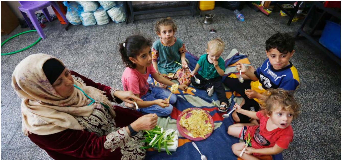
A Palestinian family gathers in an UNRWA shelter in Gaza.