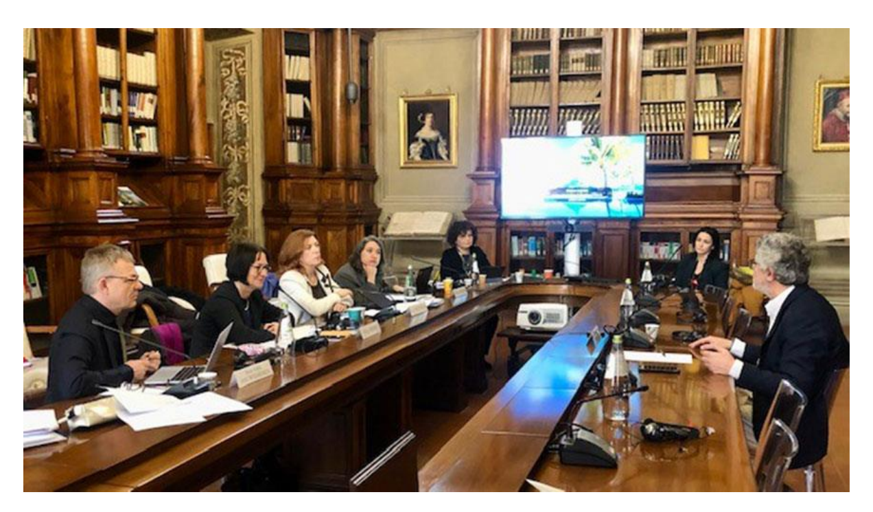
GRETA third evaluation visit to Italy, 13-17 February 2023