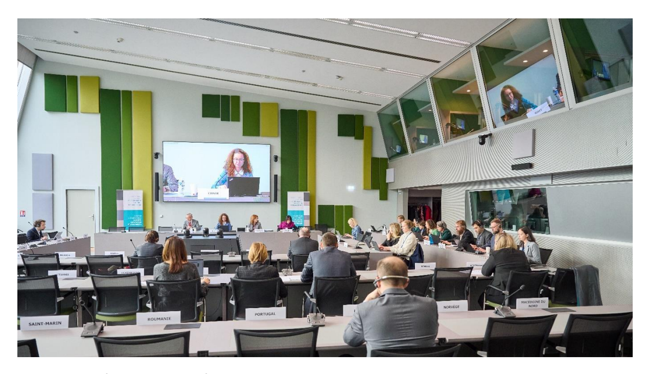
33rd Meeting of the Committee of the Parties, Strasbourg, France, 15 December 2023