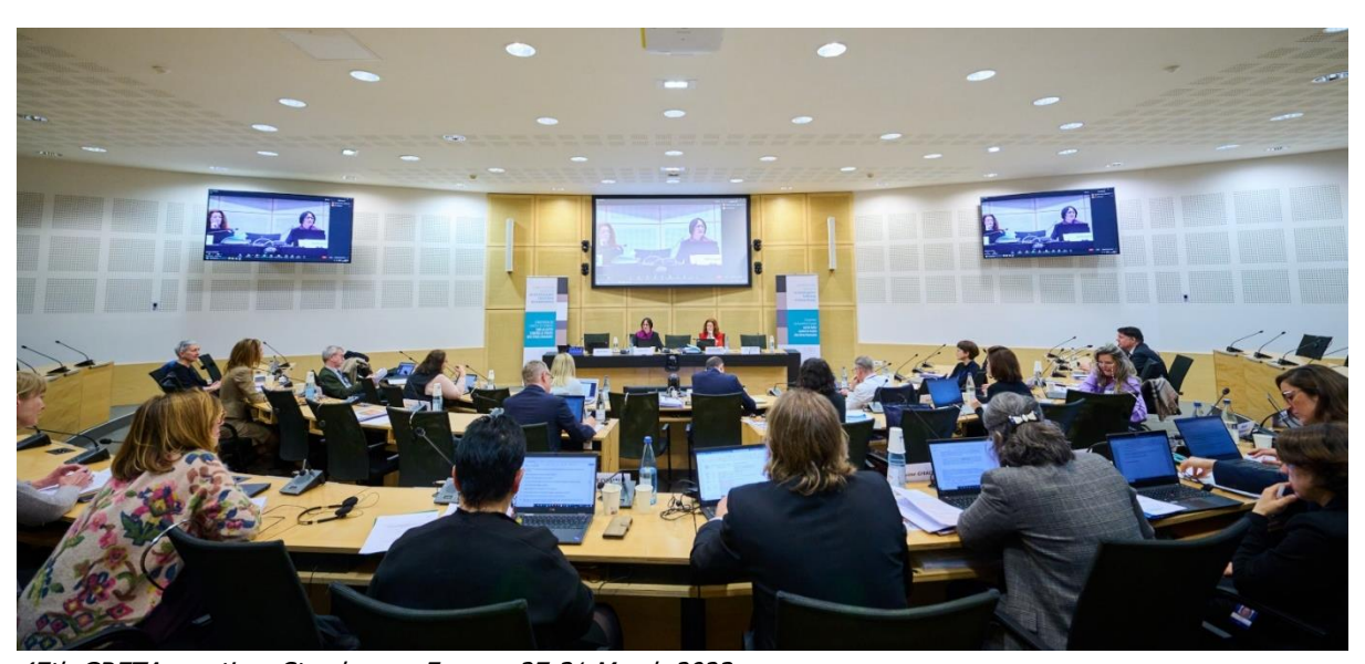
47th GRETA meeting, Strasbourg, France, 27-31 March 2023