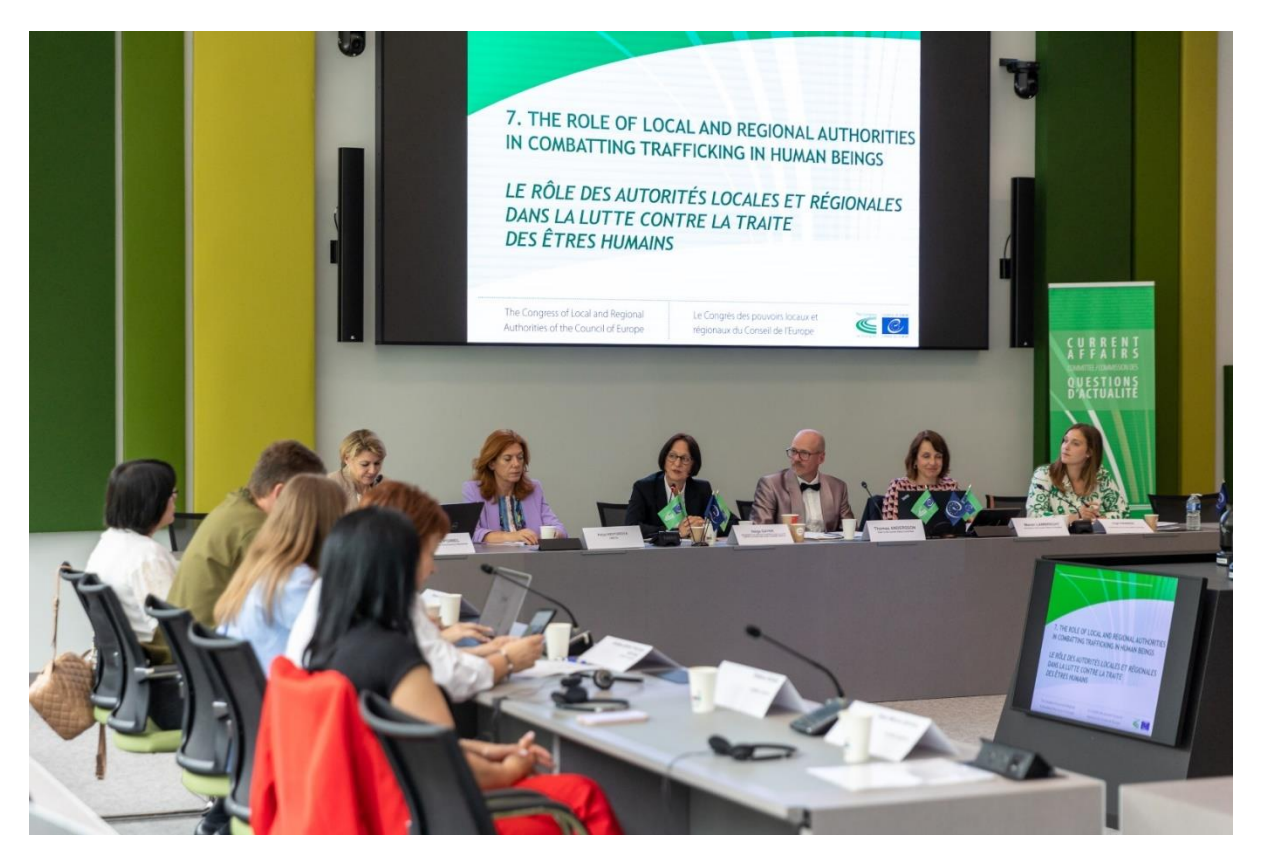
Exchange of views between the Current Affairs Committee of the Congress of Local and Regional Authorities and the President of GRETA, Strasbourg, France, 28 June 2023