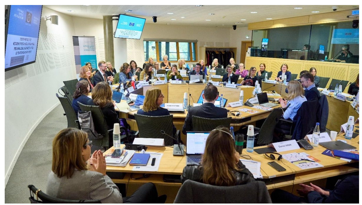
Fourth meeting of the network of lawyers and NGOs specialised in providing legal assistance to victims of human trafficking, Strasbourg, France, 26-27 October 2023

protection of victims and witnesses of human trafficking, the role of lawyers and NGOs in victim identification, and combating trafficking for the purpose of labour exploitation.