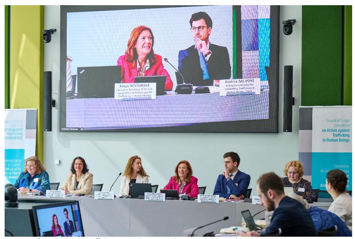
Meeting of National Anti-Trafficking Co-ordinators and Rapporteurs, Strasbourg, 6-7 June 2023