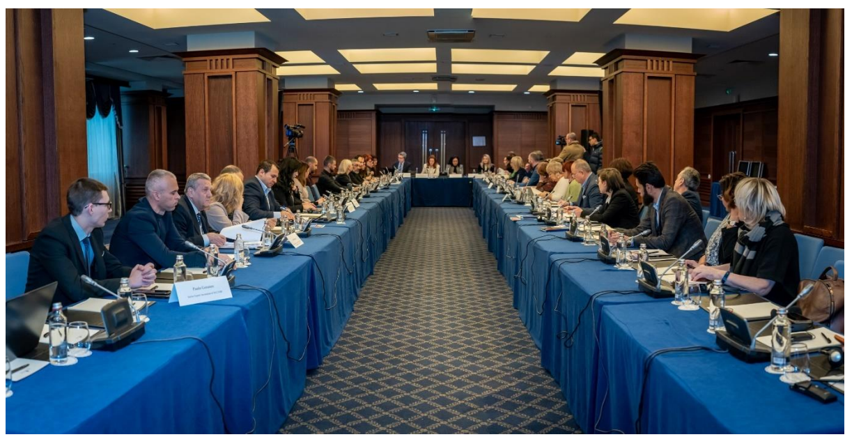
Roundtable meeting on the follow-up to GRETA's third evaluation report on Bulgaria, 30 January 2023