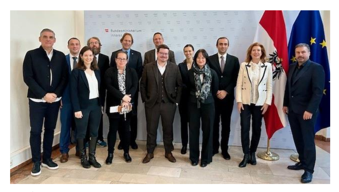
GRETA fourth evaluation visit to Austria, 11-14 December 2023