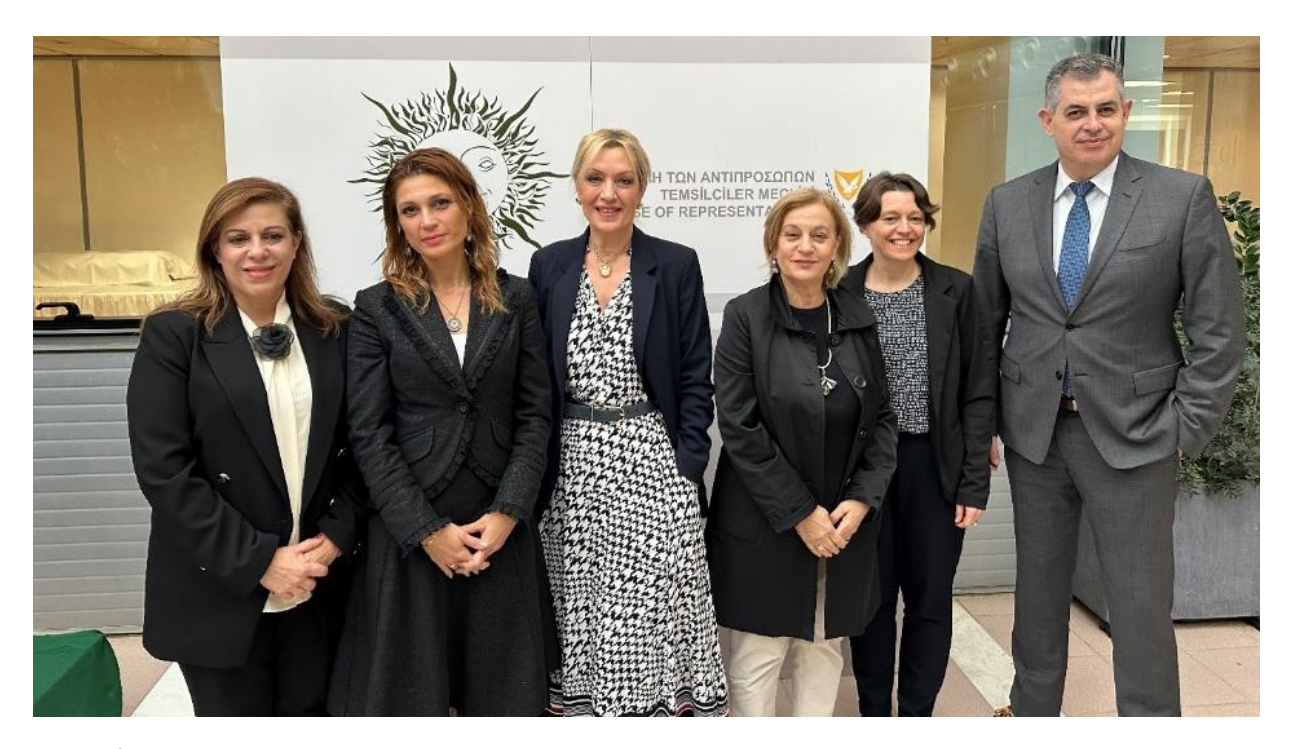
GRETA fourth evaluation visit to Cyprus, 4-7 December 2023

20. The country visits were an opportunity for GRETA to visit facilities where protection and assistance are provided to victims of trafficking, often run by NGOs, to exchange views with their staff and to speak to any victims willing to meet GRETA on a confidential basis. Specialised shelters and safe houses for victims of trafficking were visited in Cyprus, Czechia, Germany, Hungary, Italy, Switzerland and Türkiye. Further, in Finland, Monaco and San