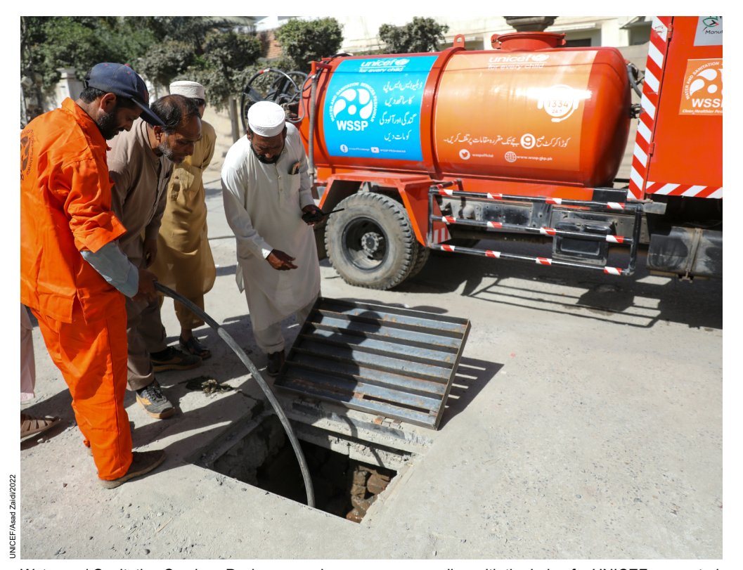
Water and Sanitation Services Peshawar workers open a sewer line with the help of a UNICEF-supported sewer rodding machine in Gulberg # 2, Peshawar, Khyber Pakhtunkhwa Province, Pakistan.

Due to depleting ground water resources, old infrastructure and sewage seeping into the main water supply lines, access to safe drinking water in the Chairman colony, a congested neighbourhood of Peshawar, Pakistan with a high concentration of registered Afghan refugees, remains a huge challenge.