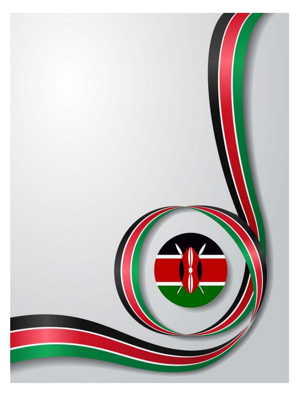
Ministry of Public Service, Youth and Gender 2019