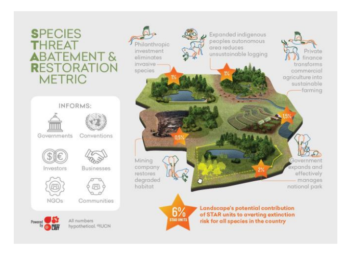
The STAR metric quantifies the impact of specific actions in specific places towards halting species extinctions. This allows businesses, governments and civil society to calculate their potential contributions to global biodiversity goals.

Other tools that can help measure progress and guide action include: the <a href="Environmental Impact">Environmental Impact</a> Classification for Alien Taxa (EICAT), the Global Species Action Plan, the <a href="Restoration Opportunities">Restoration Opportunities</a> Assessment Methodology (ROAM), the <a href="World">World</a> Database on Protected Areas and the <a href="Species Threat">Species Threat</a> Abatement and <a href="Restoration">Restoration</a> (STAR) metric.